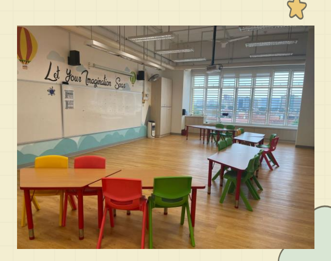
Art & Craft / Tinkering