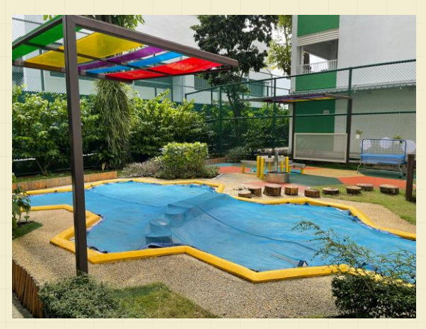
Sand & Water Play Area

Specially designed Sand & Water play area and Sensory Garden for children to use their five senses to explore and find out about the world around them.