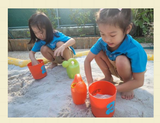
Sand & Water Play